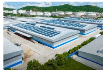
WAREHOUSES & COLD STORAGES