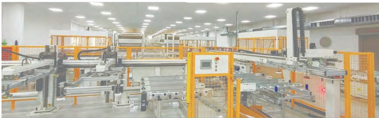
Solar Module Manufacturing Facility