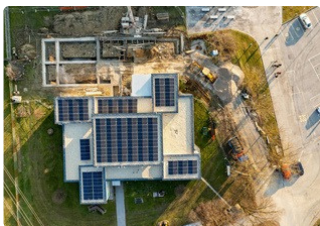
COMMERCIAL & INDUSTRIAL