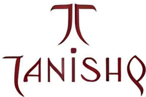
TANISHQ (A TATA PRODUCT)