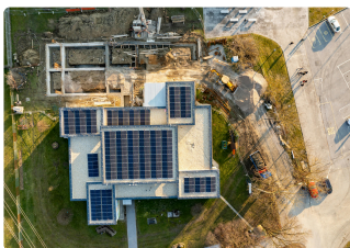
COMMERCIAL & INDUSTRIAL