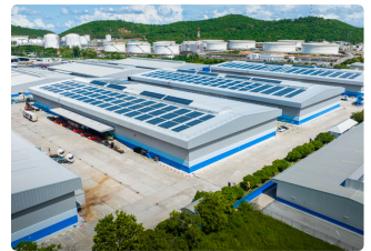
WAREHOUSES & COLD STORAGES