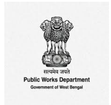
PWD (West Bengal)